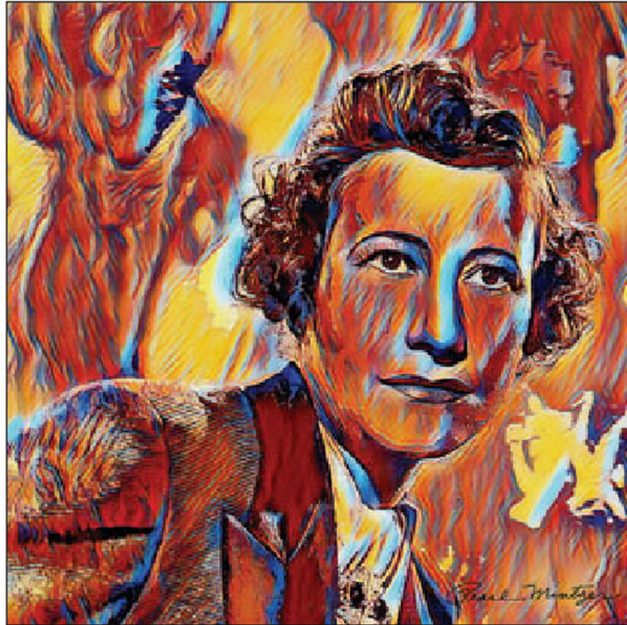
“Odette Portrait” by Pearl Mintzer.