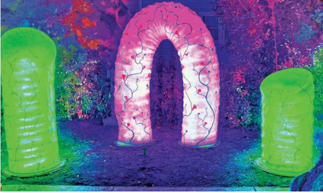
“Exhibitionist,” the newest installation of New Hope Arts Outdoor Sculpture Project at the Studio Sculpture Garden on North Main Street.

New Hope Arts celebrated the installation of its latest outdoor sculpture Oct. 18 at the Studio Sculpture Garden on North Main Street in New Hope.