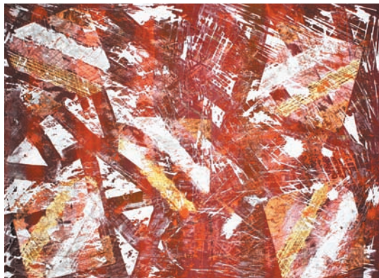
Red Eruption (natural light)