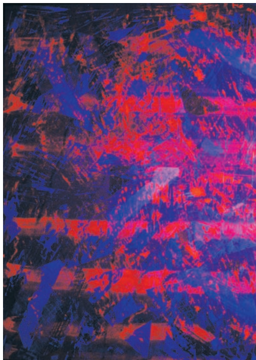
Red Eruption (UV light)

Protocol limits ten people at a time so viewers have the opportunity to interact with each piece while maintaining social distance. Reservations are suggested. Visit the website or call for more information.