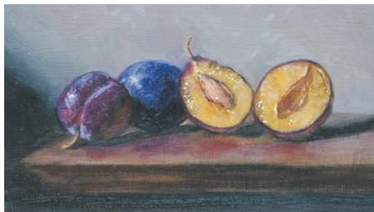
Lauren Kindle, Longing Endlessly