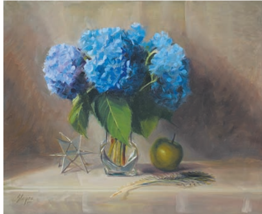
Sandy Corpora, Star Blue Hydrangea