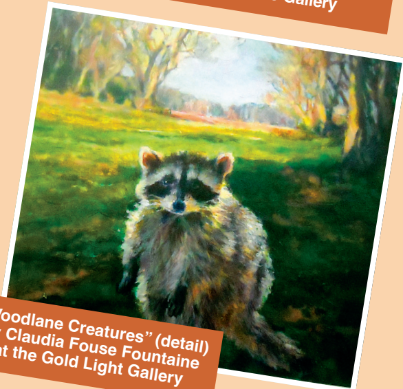
"Woodlane Creatures" (detail) by Claudia Fouse Fountaine at the Gold Light Gallery

Reception is 6 to 9 p.m. Oct. 24. The gallery is at Route 202 and Aquetong Road.