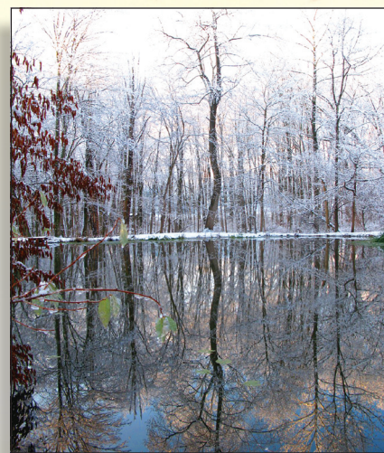
"Wavy Tree Reflections," mixed-media photography, by Natalie Searl