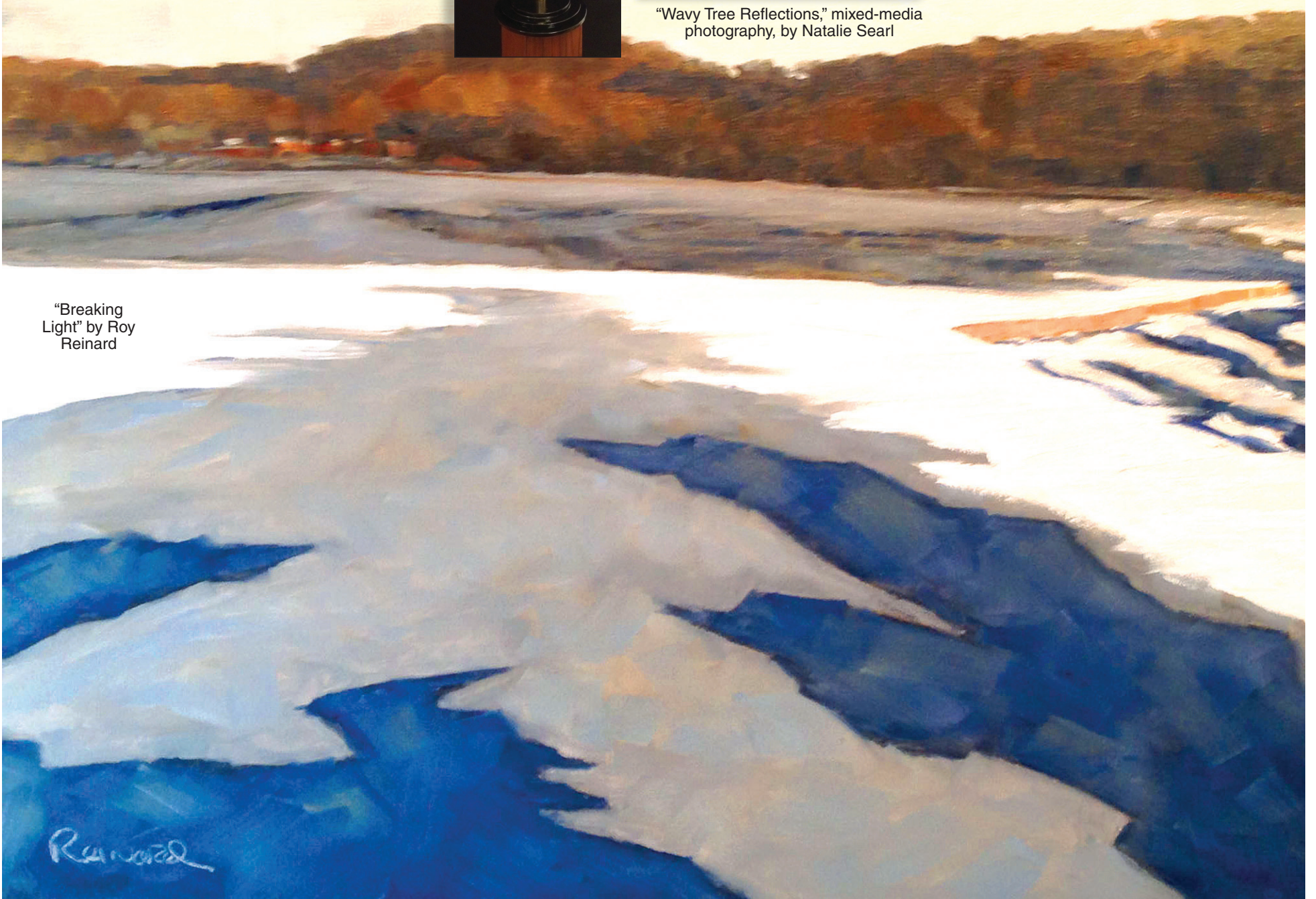
"Breaking Light" by Roy Reinard