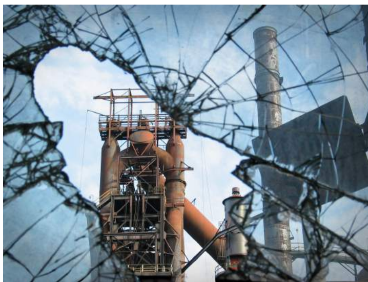
Reed framed part of the former Bethlehem Steel works in the broken glass of a factory window

When Reed visited in 2007 and 2008, a quarter-century after it closed, Pennhurst looked like it had been destroyed in a war, the people gone, their wheelchairs and hospital beds strewn about rooms and hallways.