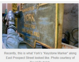
Recently, this is what York's "Keystone Marker" along East Prospect Street looked like.