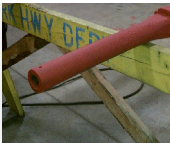
City crews have spent time recently fixing the old Keystone Marker that sits along East Prospect Street.