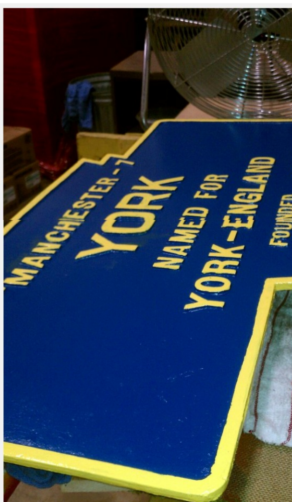
This shot shows the finished product, after city crews were done with the old sign.