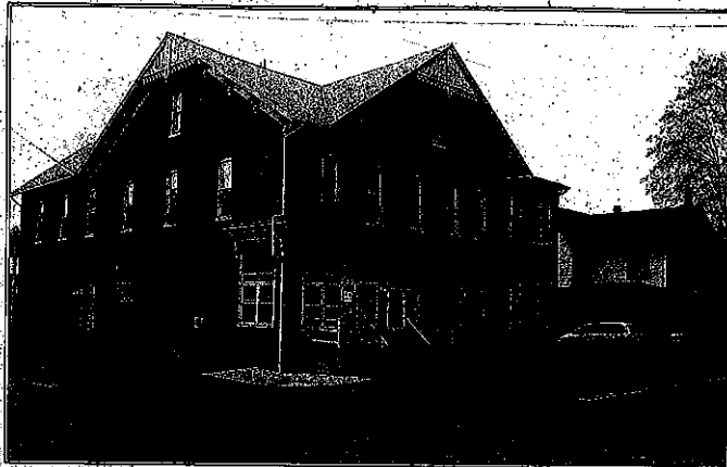
The Palace Store and Hotel in Laurelton.