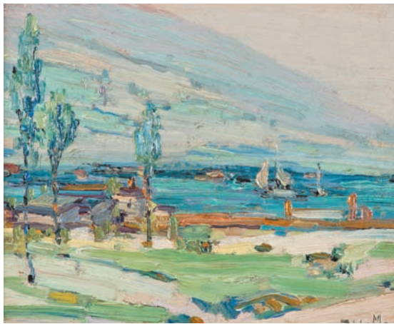
Peter Bela Mayer, "River with Boat," Oil 8 x 10