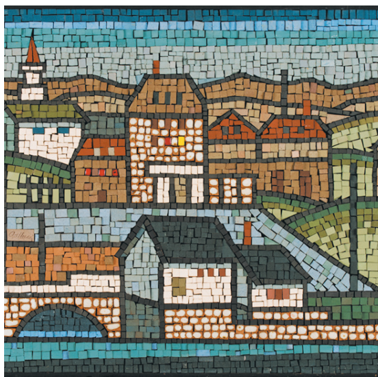
Raymond Gallucci, Town Scene, Stoneware mosaic, 16.5 x 24.5 (detail)

View the items before they are up for bid at Preview Night, Thursday, May 19, 2016 from 6:00-8:00 pm.